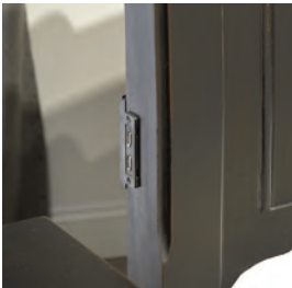
USB charging ports (412, 415, 400, 404)