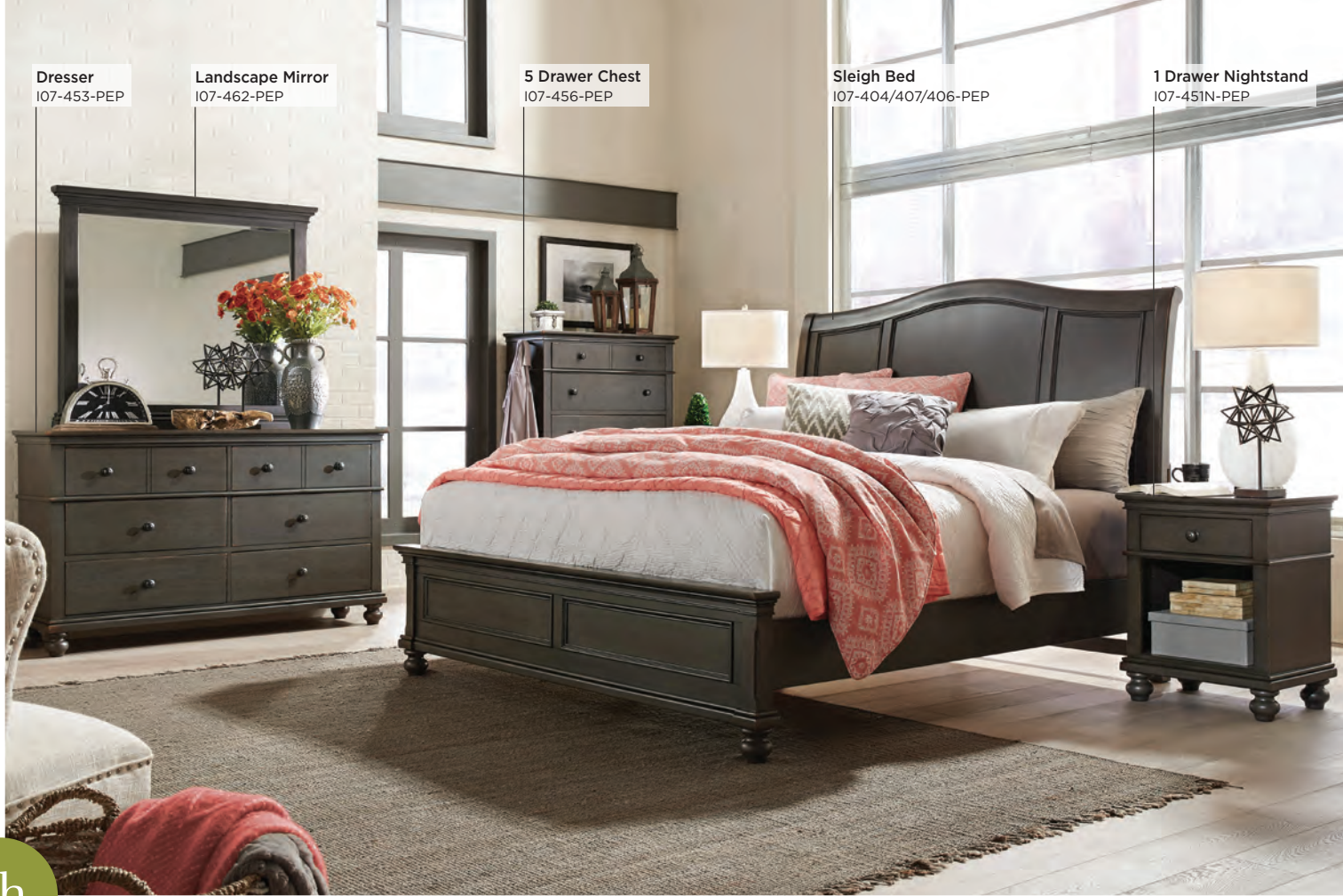
1 Drawer Nightstand I07-451N-PEP