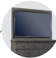
I07-487-PEP TV Frame w/ TV Mount 55W x 38H x 3D