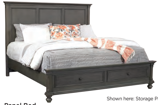
Shown here: Storage Panel Bed