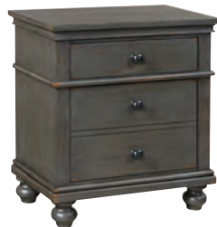
I07-450-PEP 2 Drawer Nightstand 28W x 30H x 18D