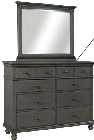
I07-462-PEP Landscape Mirror 46W x 40H x 3D