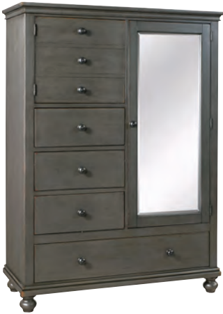
I07-459-PEP Chiffarobe 51W x 69H x 22D