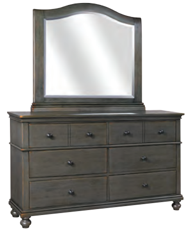
I07-463-PEP Arched Mirror 49W x 43H x 3D