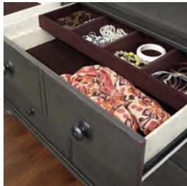
Felt lined removable jewelry tray (455)