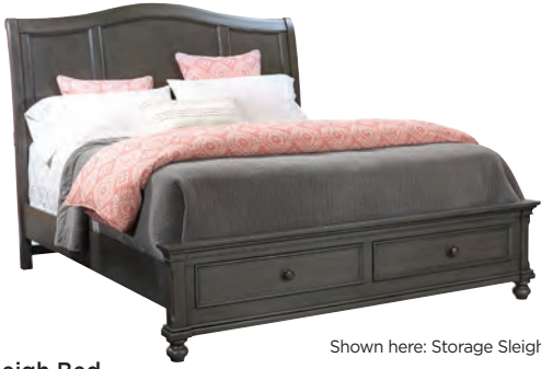
Shown here: Storage Sleigh Bed