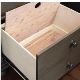
Hidden storage drawer (450)