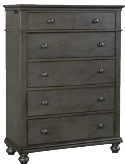
I07-456-PEP 5 Drawer Chest 42W x 57H x 18D