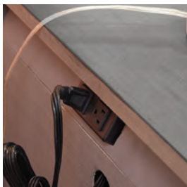
Dual canted AC outlets (450)