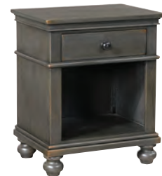
I07-451N-PEP 1 Drawer Nightstand 24W x 30H x 18D