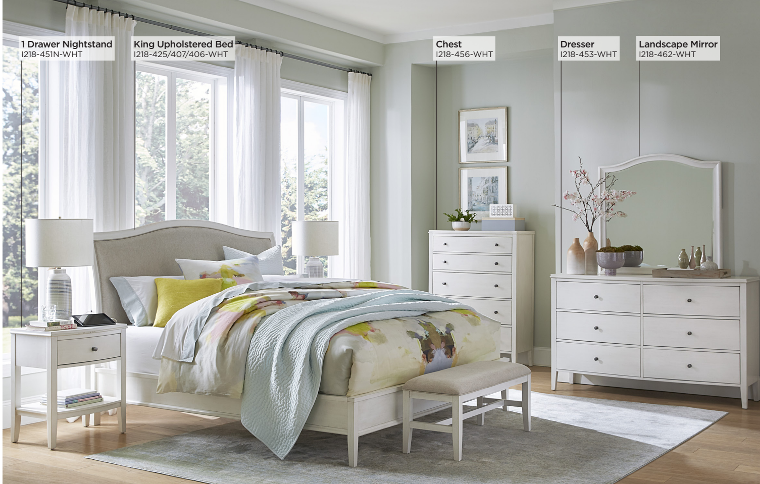
1 Drawer Nightstand I218-451N-WHT