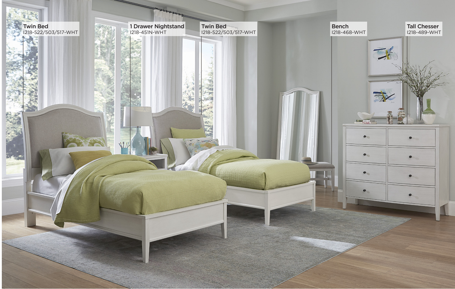
Tall Chesser I218-489-WHT