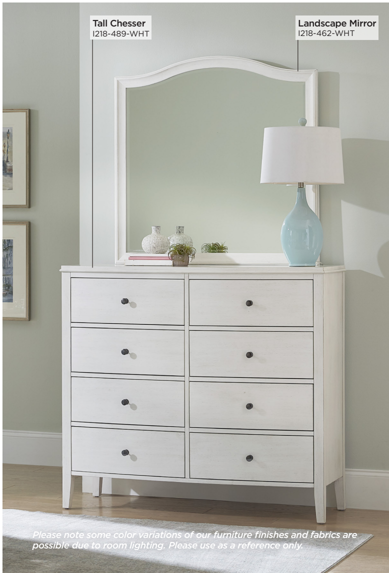
Tall Chesser I218-489-WHT