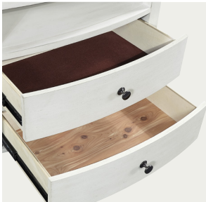
Felt & Cedar Lining