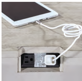
Dual Canted AC Outlets (450)