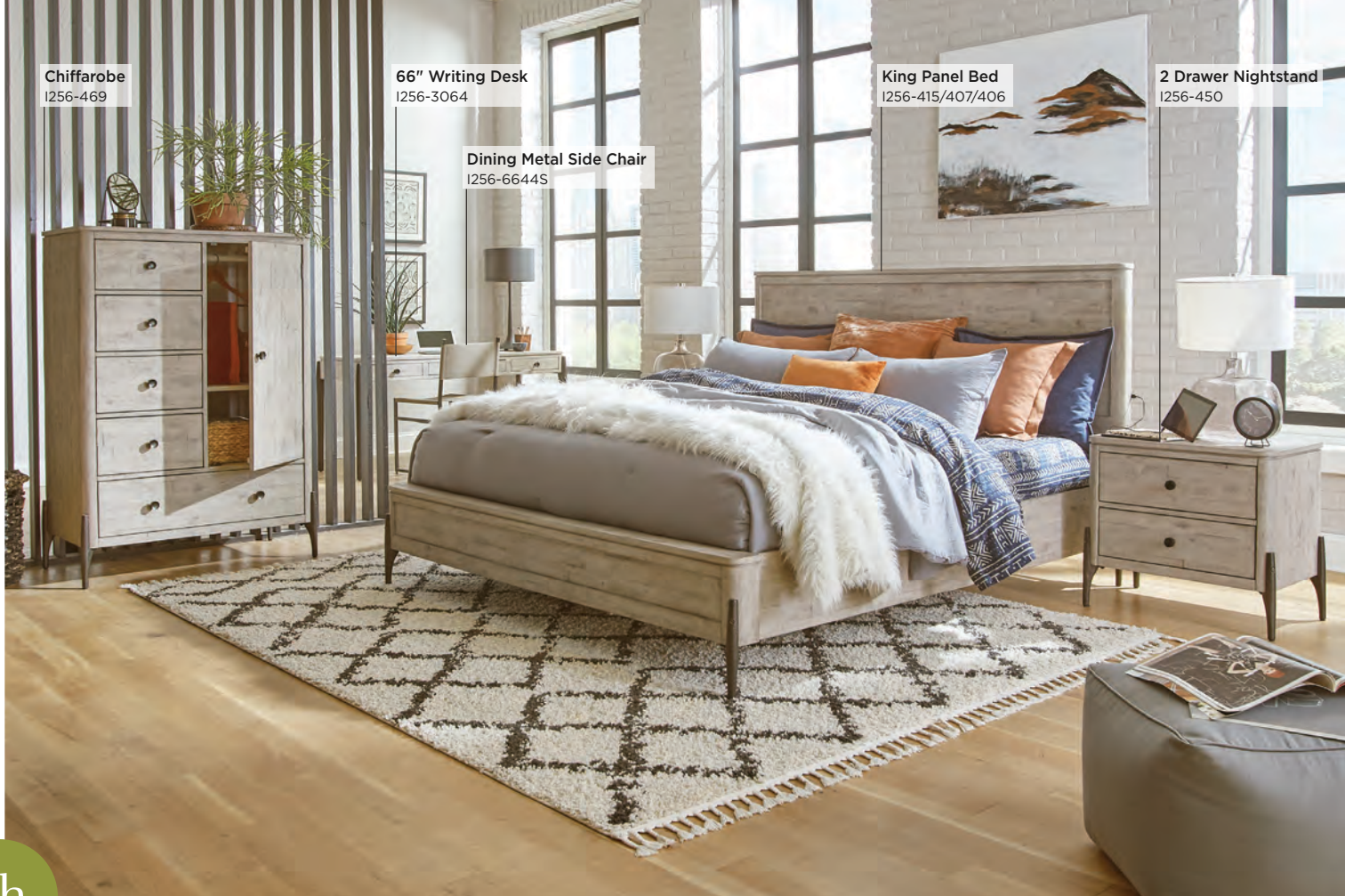
Dining Metal Side Chair 1256-6644S