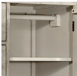
Removable Clothing Rod (469)