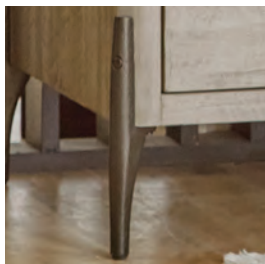
Metal Legs on Every Item in Collection