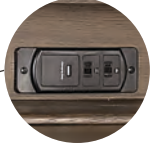
I92-321 72" Credenza Desk 72W x 39H x 26D