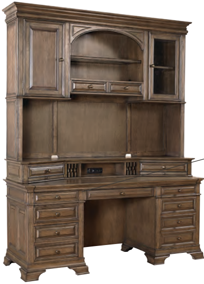
I92-319 72" Credenza Hutch 73W x 53H x 15D