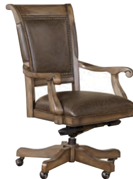
I92-366A Office Chair with Arm 27W x 40H x 26D