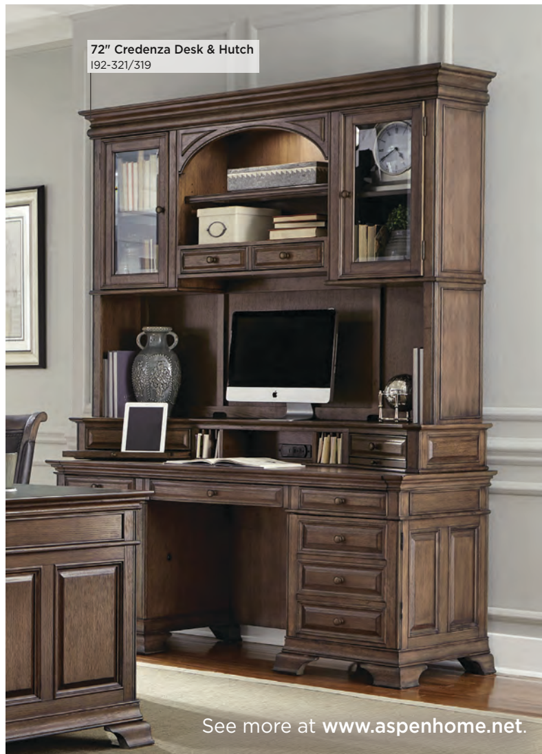
72" Credenza Desk & Hutch 192-321/319