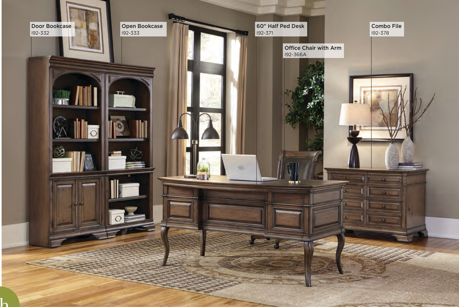
Office Chair with Arm 192-366A