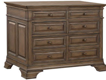
I92-378 Combo File 43W x 31H x 24D