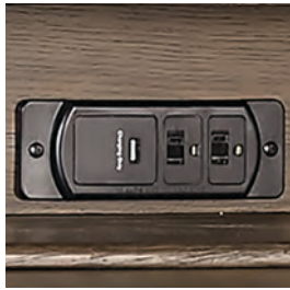
AC & USB Outlets (316, 308)