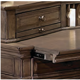
Extendable Work Surface (316, 308)