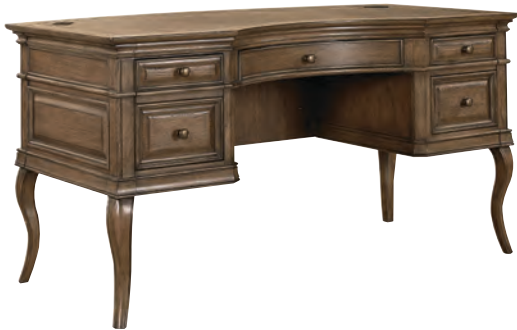
I92-371 60" Half Ped Desk 61W x 31H x 32D