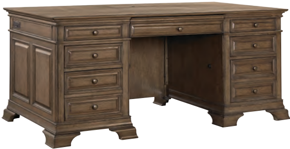
I92-300T/300B 72" Executive Desk 73W x 32H x 35D