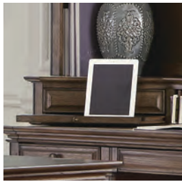
Pullout Tablet Holder (303, 307, 316, 378)