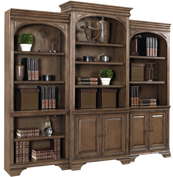
I92-333 Open Bookcase 32W x 78H x 15D