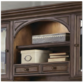
Touch Lighting (303, 307, 316)