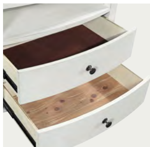
Felt & Cedar Lining