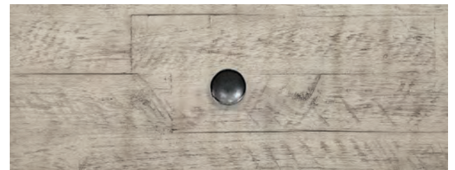
Parchment Finish with Matte Black Finish Hardware