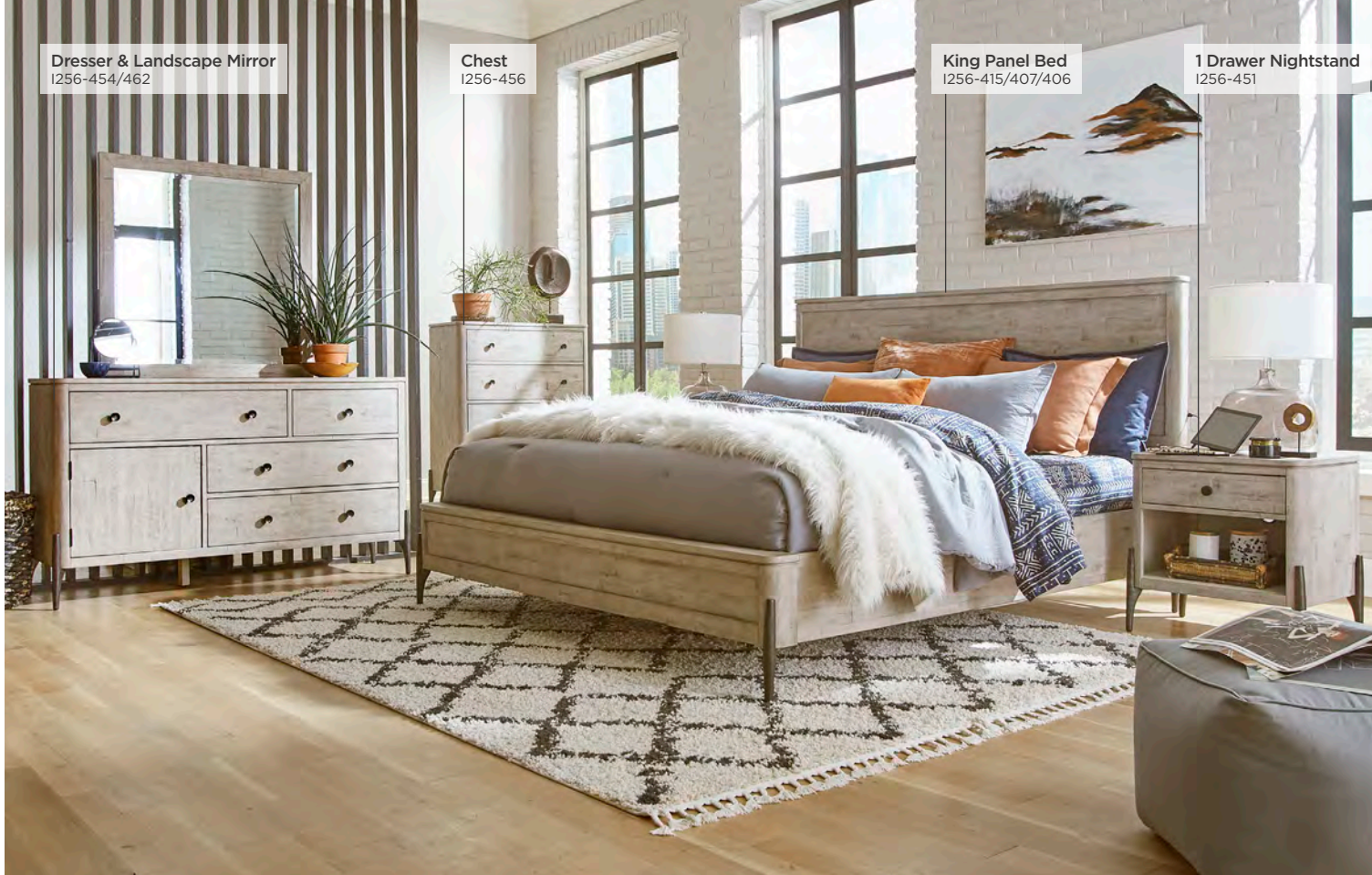
Dresser & Landscape Mirror I256-454/462