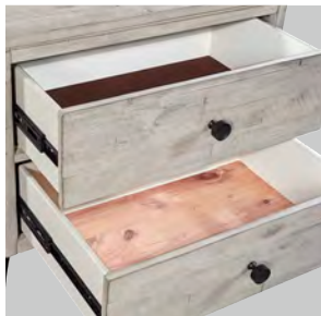
Felt & Cedar Lined Drawers