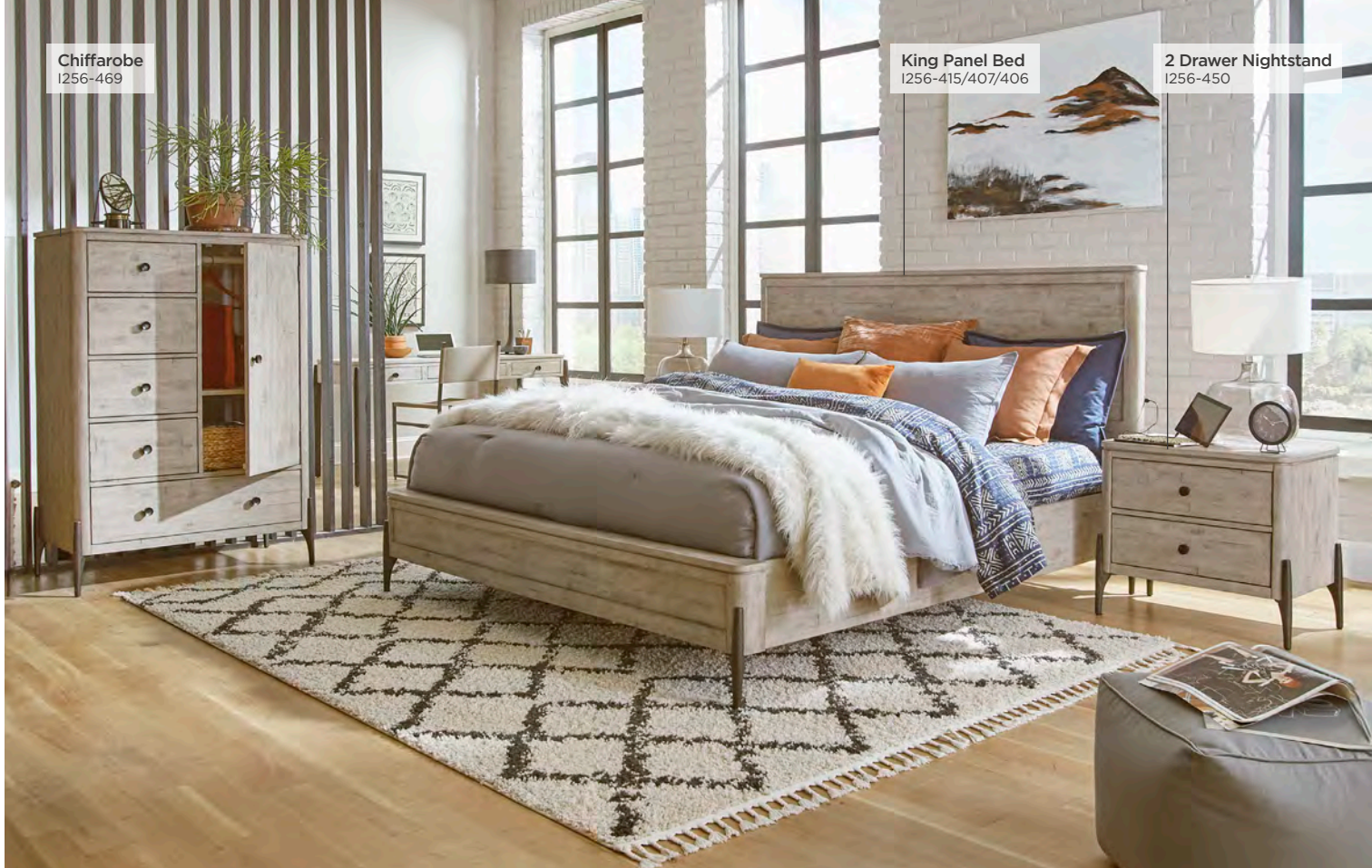
2 Drawer Nightstand I256-450