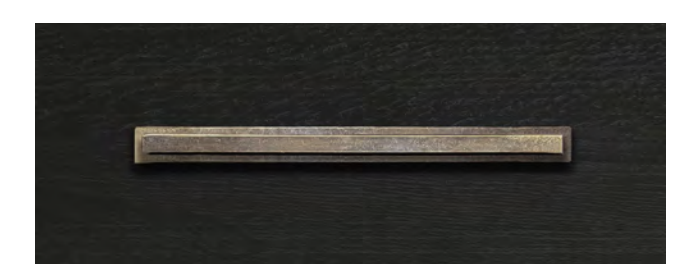
Domino Finish with Bronze Finish Hardware