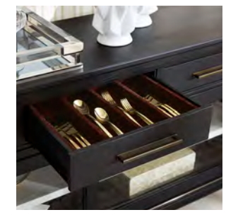
Felt Lined Silverware Tray