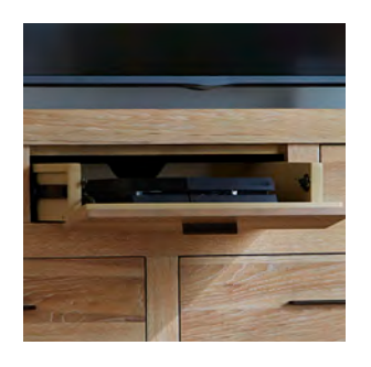
Drop Front Media Drawer